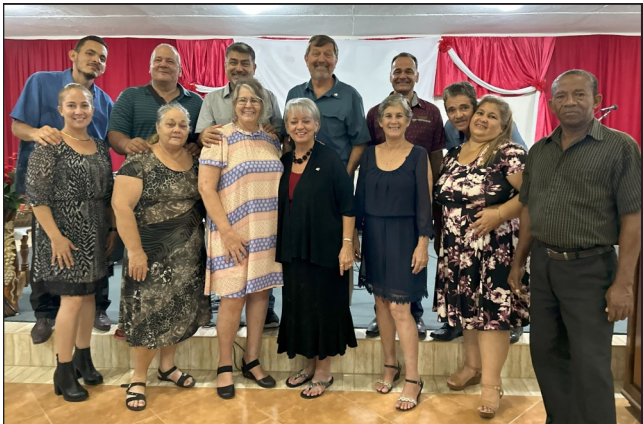
This is our core teaching staff. Also included in the retreat will be the worship team, trainees, and our trip coordination staff.

back to their homes in the different provinces following the conferences and some extra for the following week that we spend in Palmira (the base of operations for the denomination that we work with) visiting house churches and family.